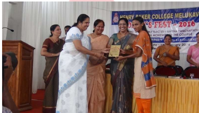
Honouring newly elected lady members of Grama Panchayath and Block Panchayath