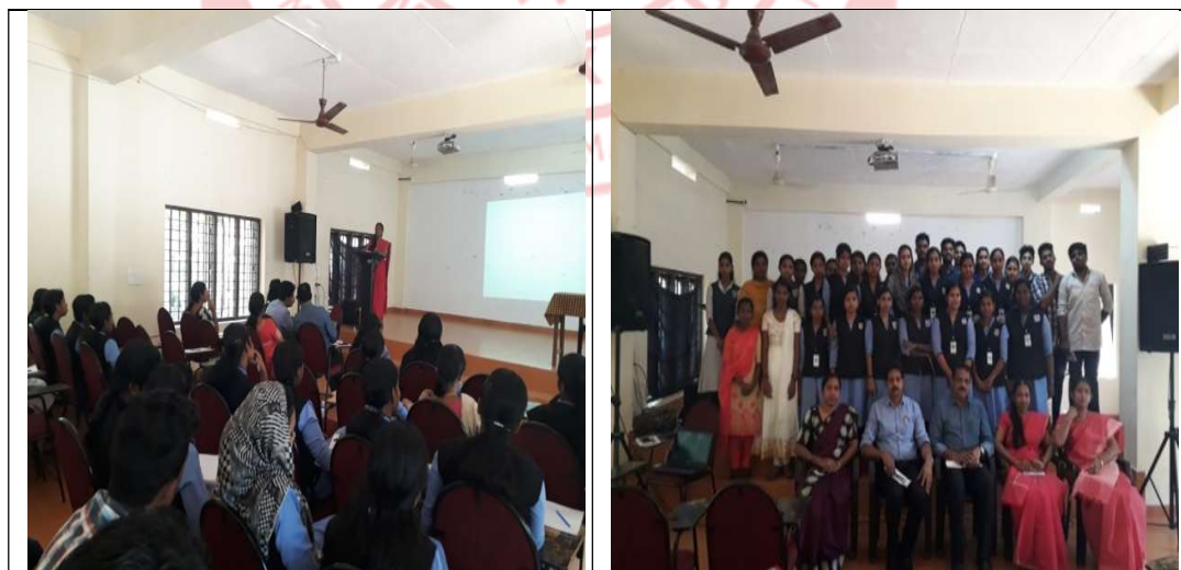
Oral History Team with Principal and Resource Persons